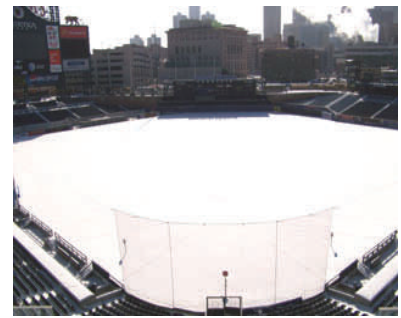
The view from our seats in February

Send check or money order payable to Friends of Notre Dame. Tickets will be mailed to you no later than August 11, 2008. Confirmation email will be sent once payment is received. Transportation, parking, and food are not included in price of ticket.